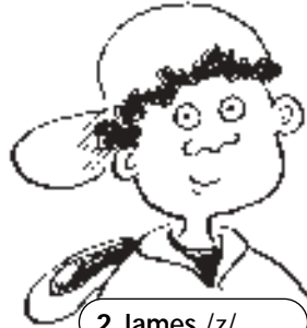
2 James /z/