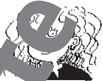
3 Mercedes /ɪz/

2 Listen to the headless sentences. Pay attention to the sound of the s and es verb endings. Is it /s/, /z/ or /ɪz/?